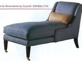
Atter chaise ($2,632) designed by Randy Culler for Brownstone by Council, 336/859-2155.

"A chaise is ideal for extra seating in a living room, but the most luxurious use is for comfort in a bedroom."