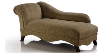
9410 Lynn Ellen Chaise