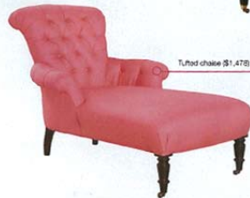
Tufted chaise ($1,472) by Lee Industries, 800/892-7150.